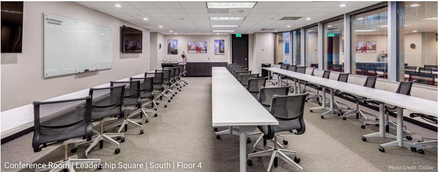
Conference Room | Leadership Square | South | Floor 4