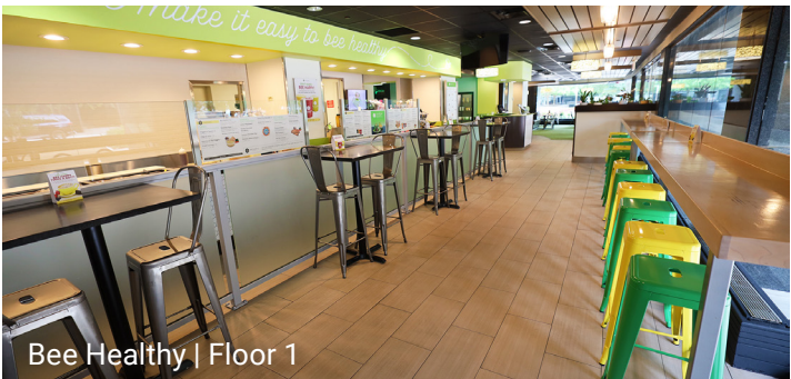
Bee Healthy | Floor 1