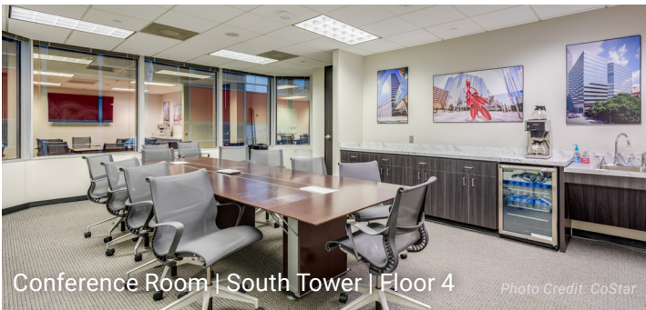
Conference Room | South Tower | Floor 4